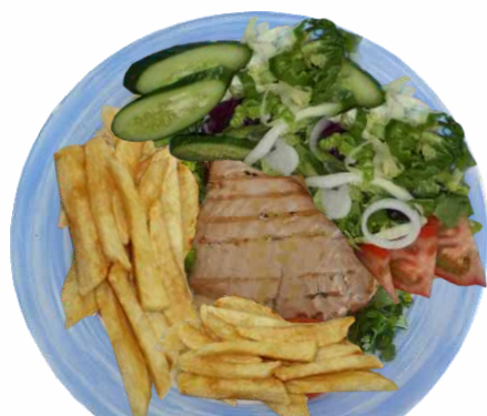
TUNA FISH FILLET