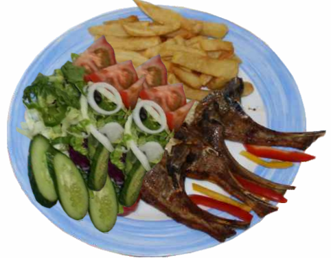
LAMB CUTLETS ILIOS