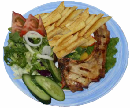
PORK CHOP FILEAS