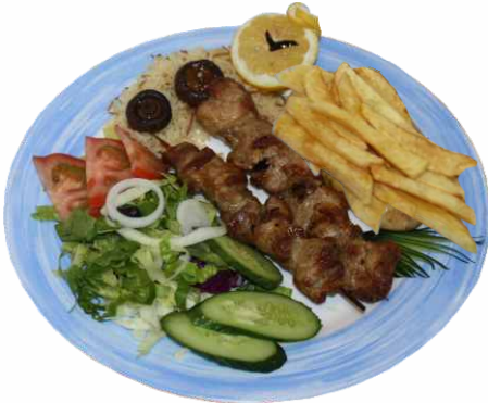
PORK FILLET SOUVLAKI ODYSSEY